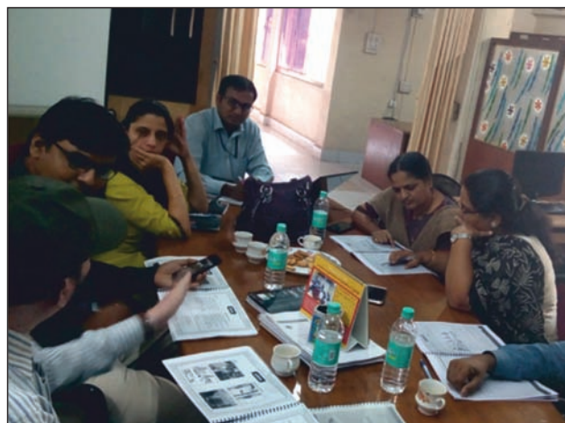
Counselor Module Preparation Workshop