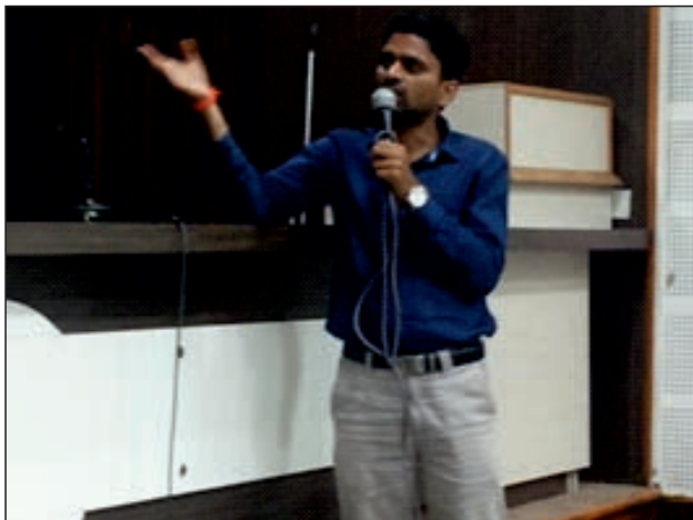
DHP Workshop Aurangabad