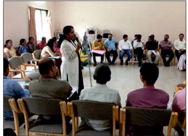
DHP Workshop Kolhapur