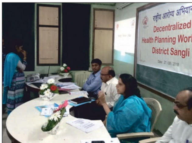
DHP Workshops (Kindly club)