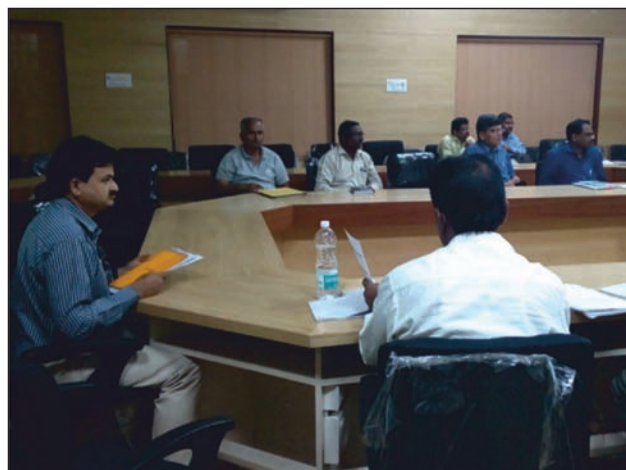
Counselor Module Preparation Workshop