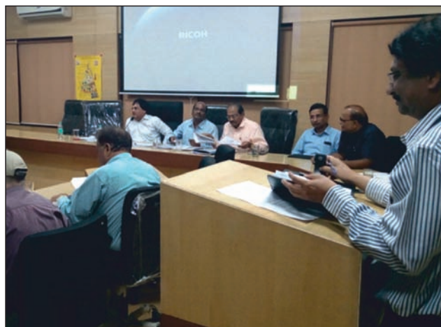
Counselor Module Preparation Workshop