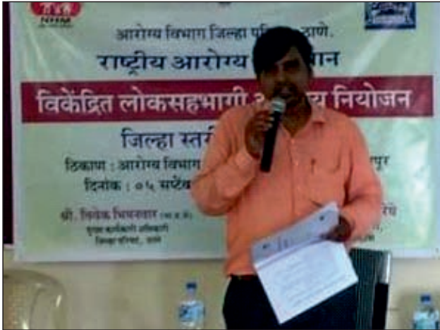
DHP Workshop Osmanabad