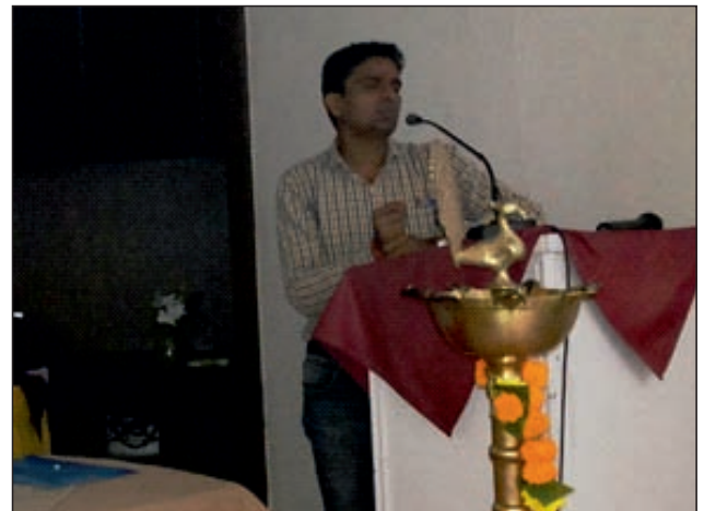
DHP Workshop Chandrapur