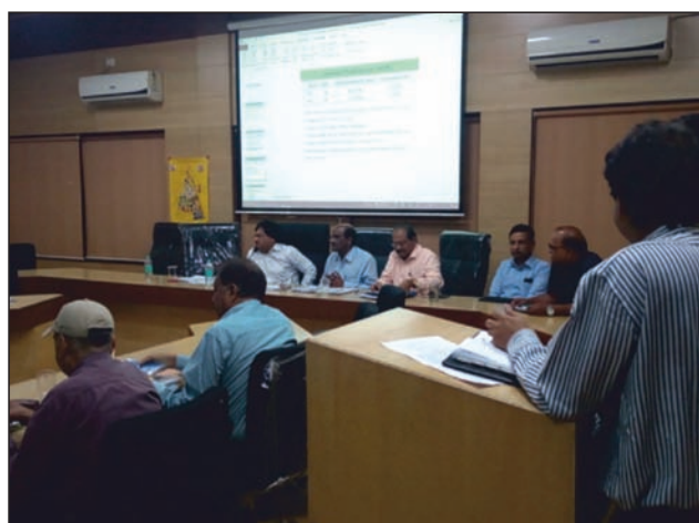
Counselor Module Preparation Workshop