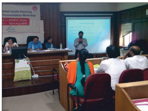
DHP Workshops (Kindly club)